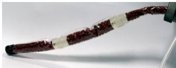
Figure 1. A granular jammed robotic limb for endoscopy

P. Dasgupta is with the Department of Urology, King's College London, London, SE1 9RT, UK (e-mail: lynne.saker@kcl.ac.uk)